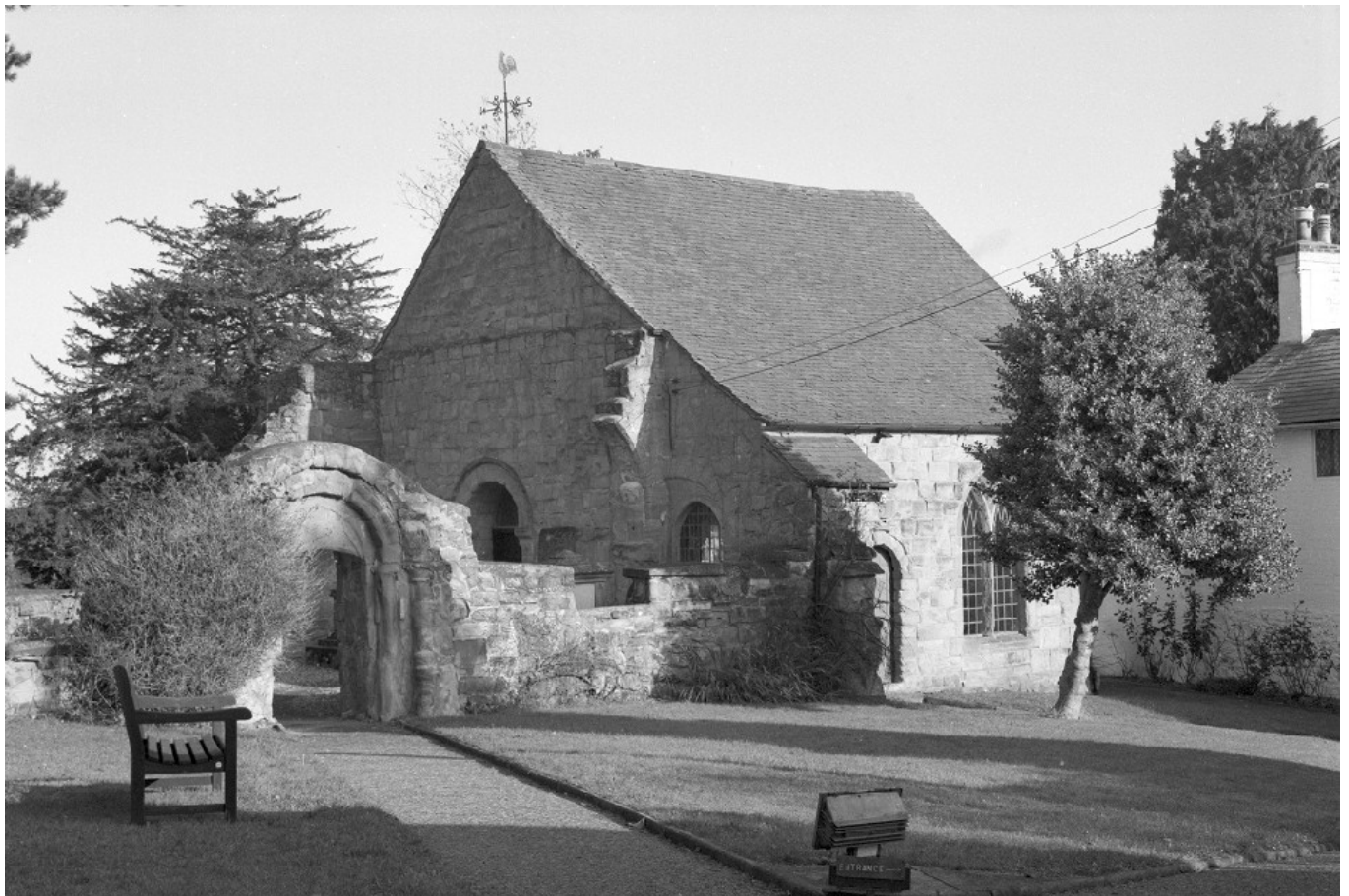
Exterior, general view

N. Pevsner, The Buildings of England. Worcestershire . Harmondsworth 1968, 67.